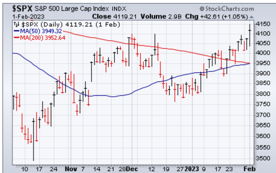
Past performance does not guarantee future results

Four days into January, a better-than-expected Nonfarm Payrolls report sparked a wave of short-covering that morphed into an upside rout for the bears. Some pundits exclaimed it was the start of a new bull market. But from our vantage point, we still don't have all the pieces in place to make that call yet. By most measures, like many of the rallies of 2022, this latest rally was led by very low-quality stocks. To wit, the Goldman "most heavily shorted" index rose +21% in January alone. The Roundhill "meme stock" index rose +25%. And so on. But an index like the Dow, supposedly made up of quality, blue chips stock, rose less than 3% for the month.